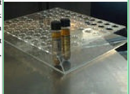
Example of a potential new rack